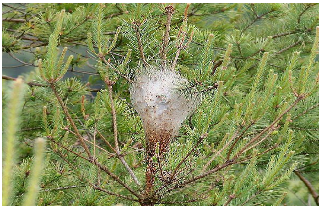
Detail of silk 'tent' of the Pine Processionary Moth ( Thaumetopoea pityocampa ) atop a Scots Pine ( Pinus sylvestris ).

In infested pine forests, it is easy to detect the presence of T. pityocampa by the cylindrical egg masses laid on the low branches of trees and by the early damage caused by the 1st- and 2nd-instar caterpillars. They feed on the needles of twigs close to the silken nest; these partially eaten twigs remain on the tree with their brown and yellowing needles. During the winter, defoliation increases and the white nests stand out plainly.